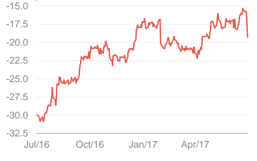
Time period 01/07/2016 to 30/06/17